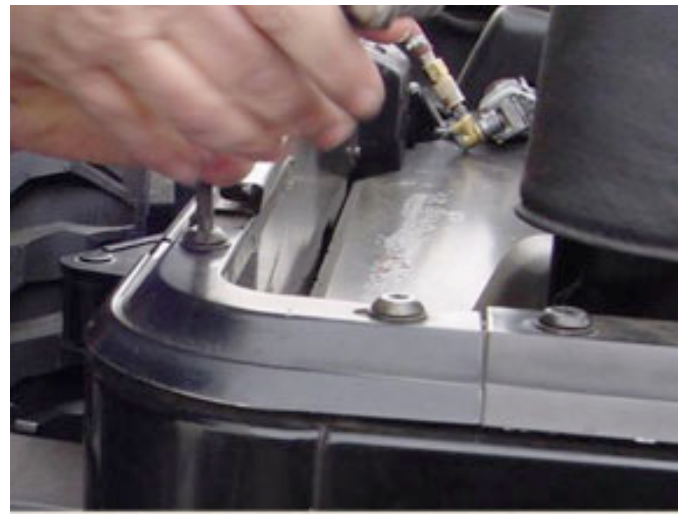
4. Remove soft top corner moldings.