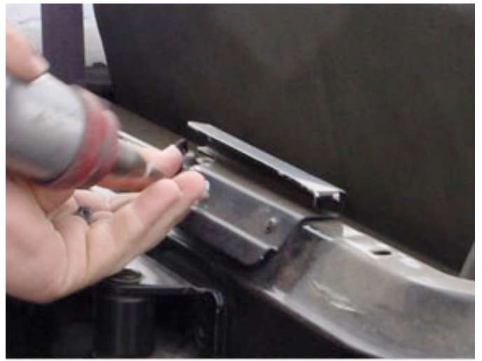
5. Remove soft top rear moldings.