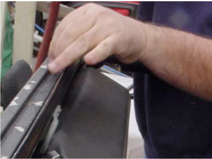
2. Remove soft top moldings around tub.