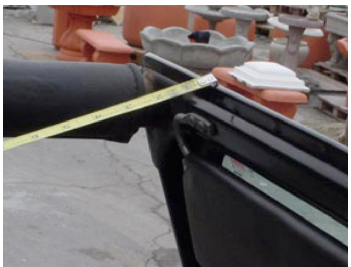
6. Attach tape to windshield frame.