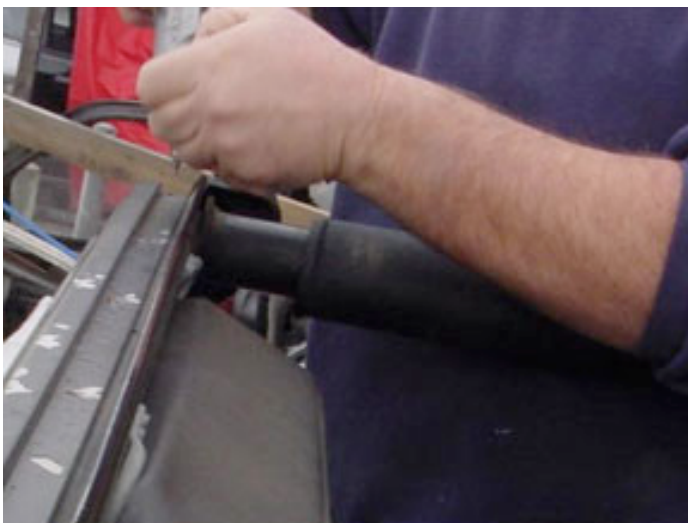
3. Remove soft top molding above windshield.