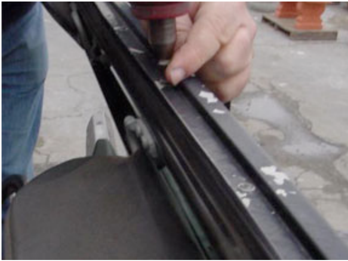
1. Remove soft top moldings around tub.