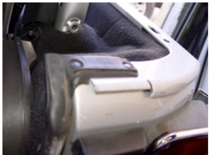
12. Do Not Remove Rear End Seals.