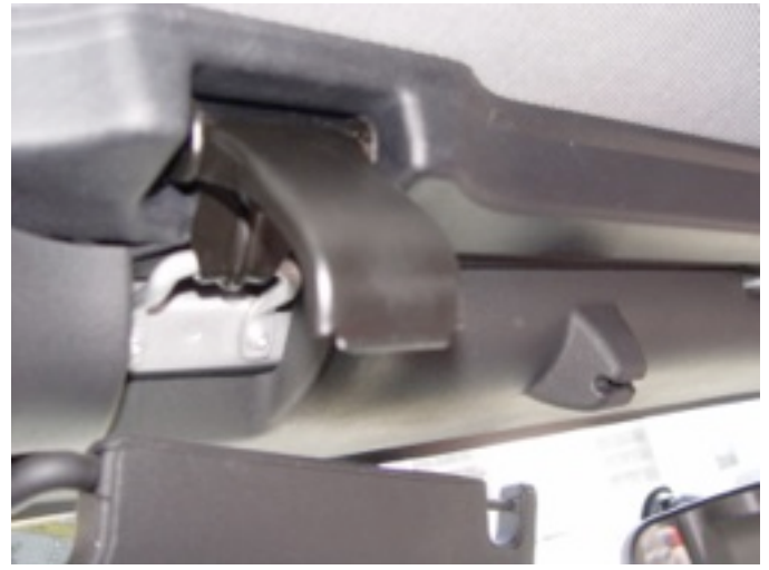
2. Disengage front clips and remove 2 screws holding the retainer loop. Remove loop. Both sides.