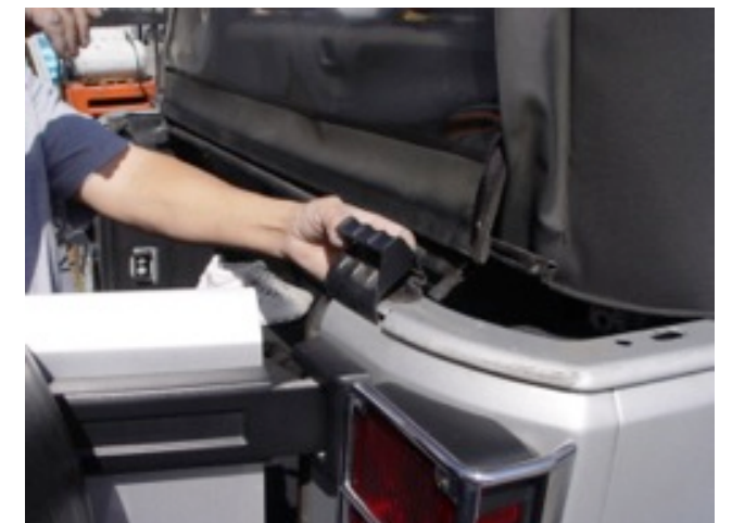
5. Remove retainers. (Left & right)