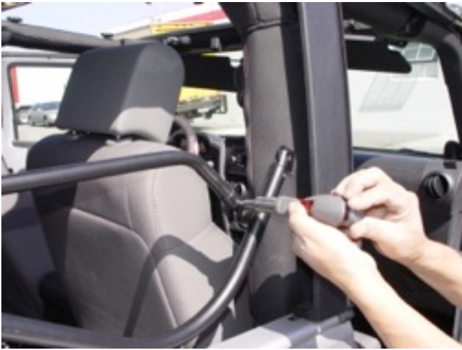
7. Unscrew the 2 soft top brace attach points. (Left & right)