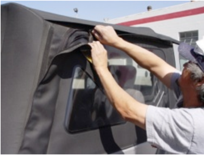
1. Remove side windows. (Left & right)