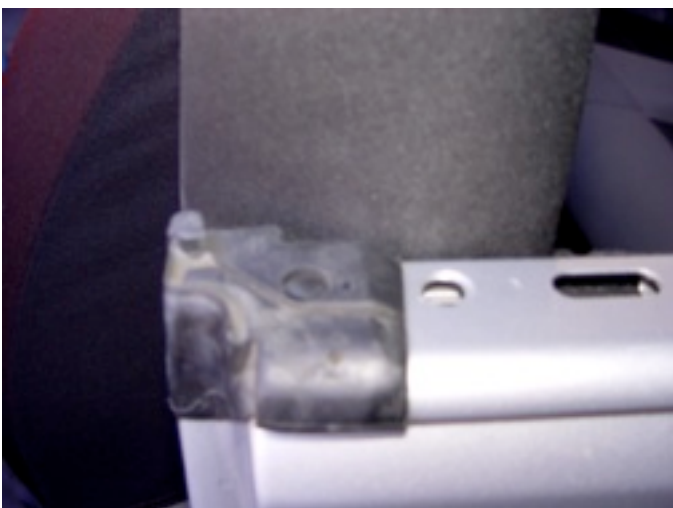
11. Do Not Remove Front End Seals.