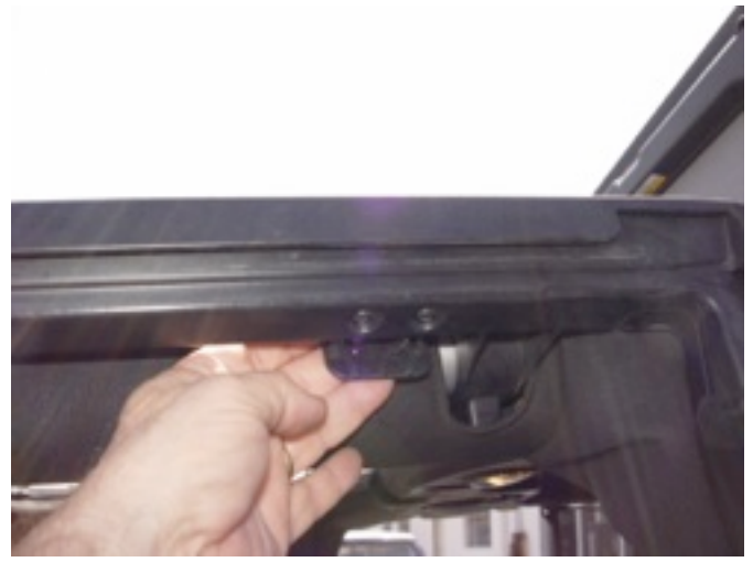
8. Disengage soft top rail retainers. (Left & right)