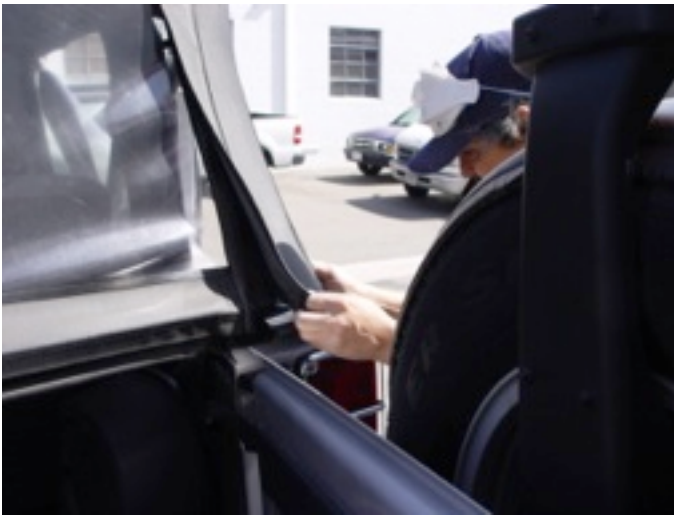
3. Disengage soft top in rear corner. (Left & right)