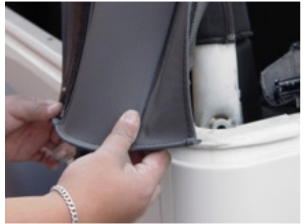
4. Pull down on corners and disengage.