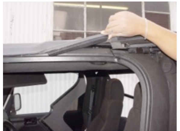
6. Remove side connections to door frame.