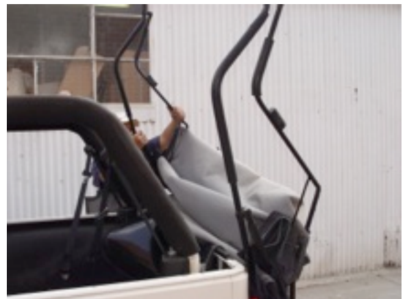
11. Remove soft top.