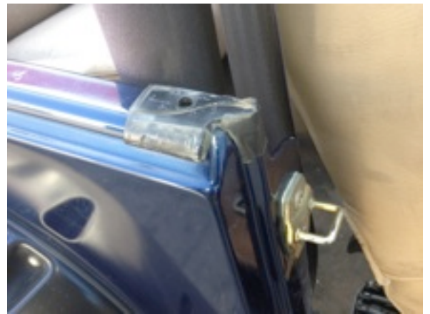
15. Do not remove front corner seal.