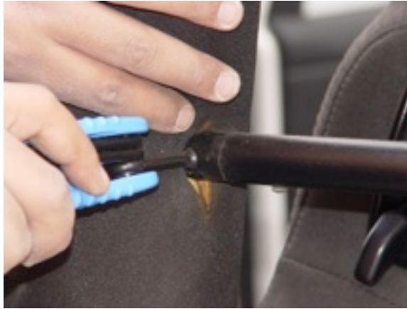
9. Remove bolt from soft top frame.