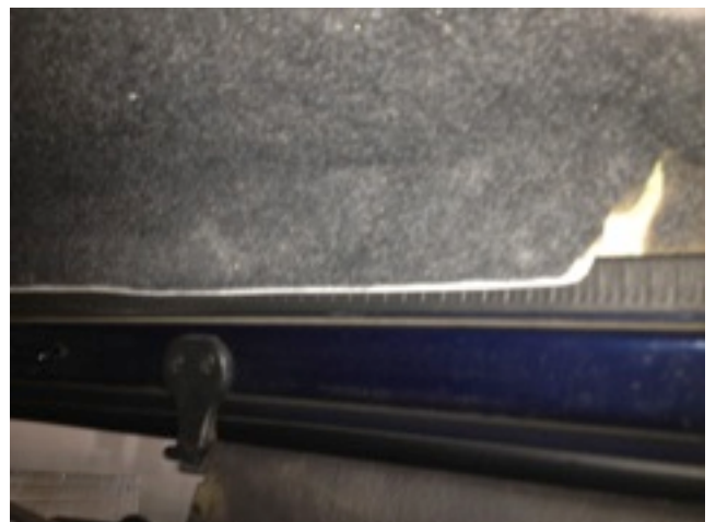
17. Sit in the front seat. Make sure the windshield stop is not hung up on the molding. It should look like this.