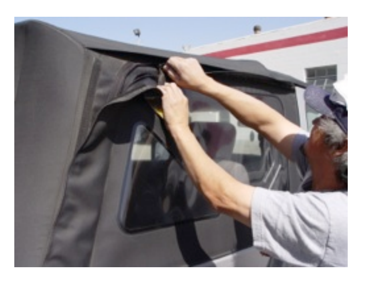
Remove side windows. (Left & right) 1.