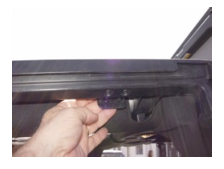
8. Disengage soft top rail retainers. (Left & right)