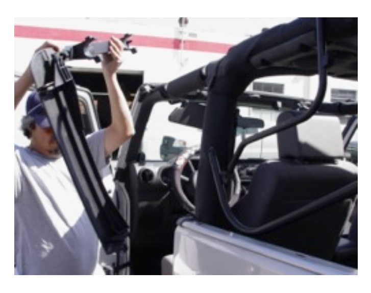
9. Remove rails. (Left & right)