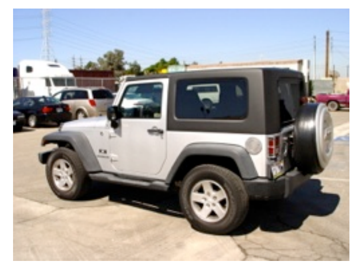
13. Using at least 2 people, place hardtop on the Jeep.