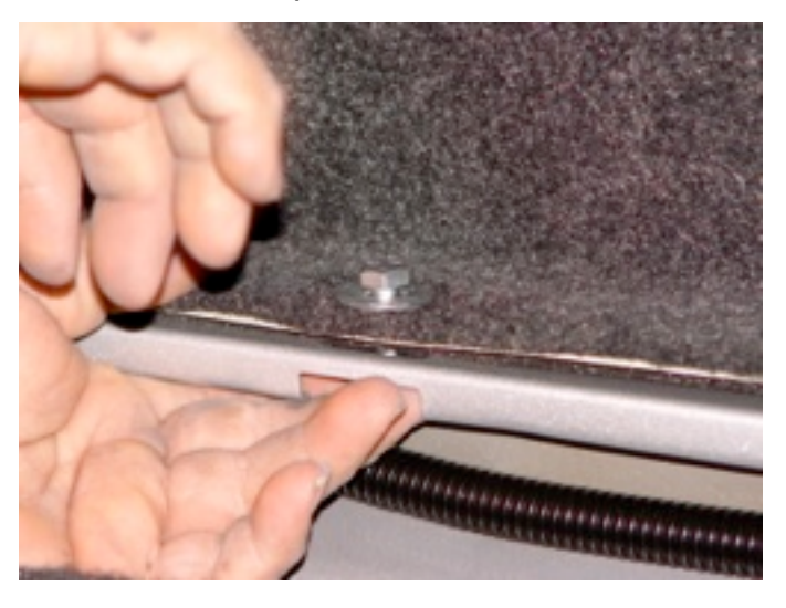
15. Install the side rail bolts using the supplied washers and nuts. Do not tighten.