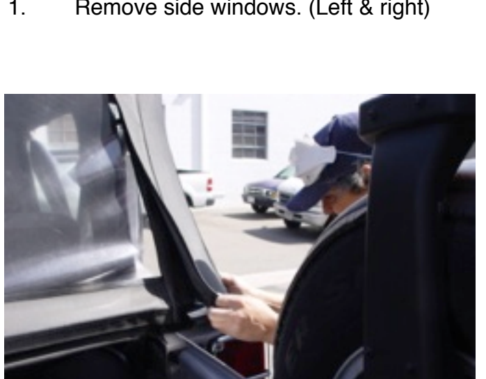
3. Disengage soft top in rear corner. (Left & right)