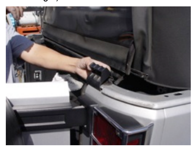
Remove retainers. (Left & right) 5.