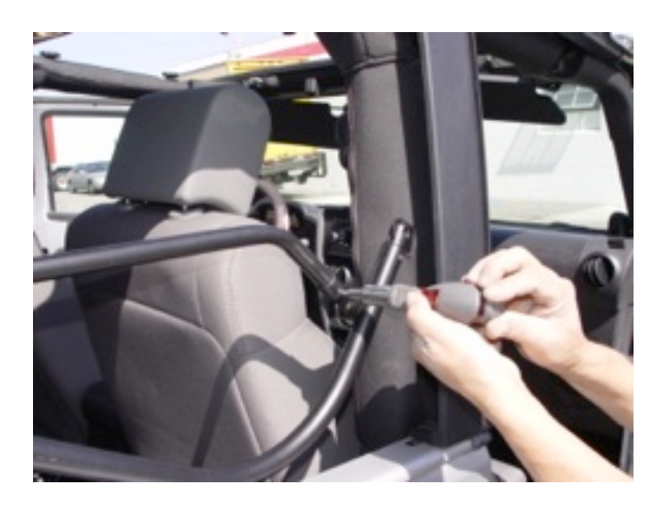
7. Unscrew the 2 soft top brace attach points. (Left & right)