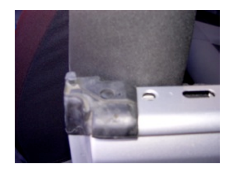
11. Do Not Remover Front End Seals.