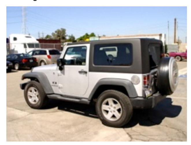
17. Tighten the rail bolts down and engage the front clips. Make sure the doors open and close freely. It may be necessary to adjust the top forwards or backwards.