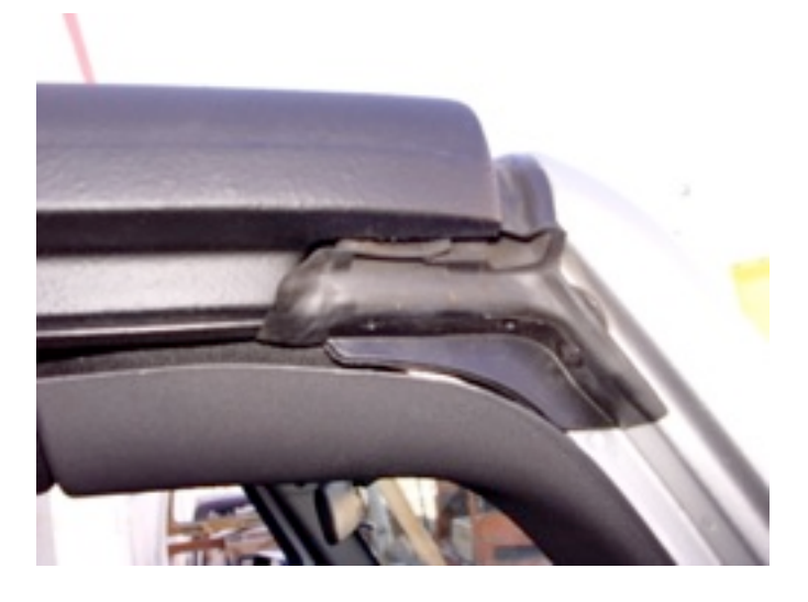
14. It should look like this in the front.