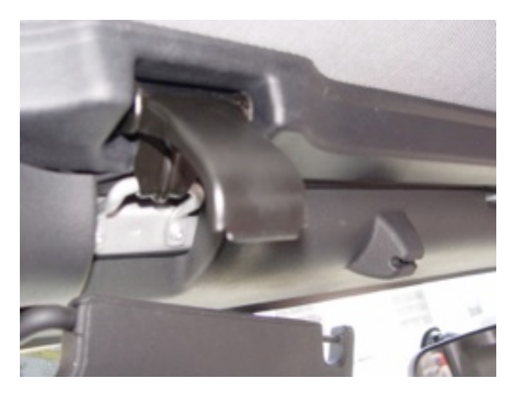
Disengage front clips and remove 2 2. screws holding the retainer loop. Remove loop. Both sides.