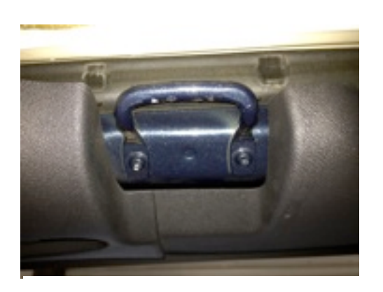
16. Adjust the camlocks to medium tension and engage the camlocks.