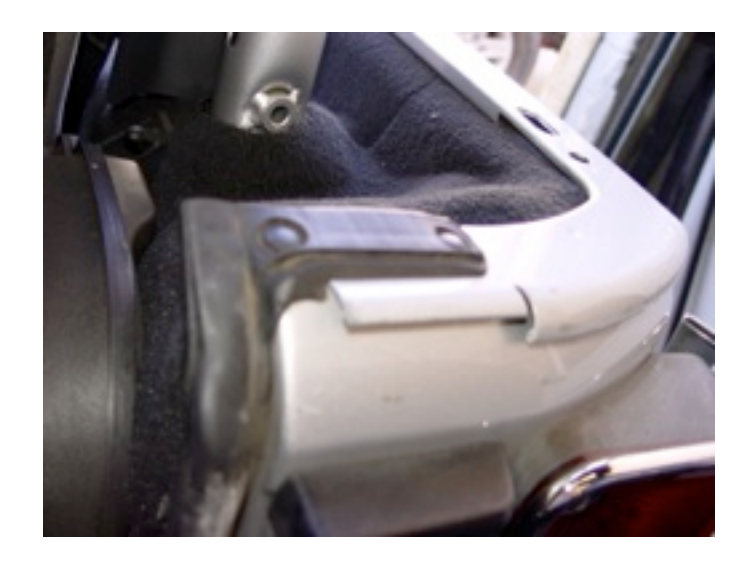
12. Do Not Remover Rear End Seals.